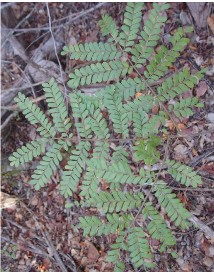
??? - small tree