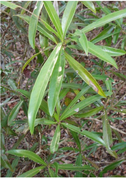
Macphersonia gracilis - shrub