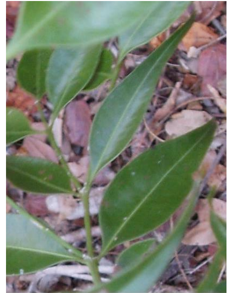
??? - shrub