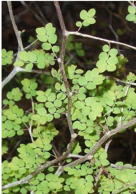
??? - shrub